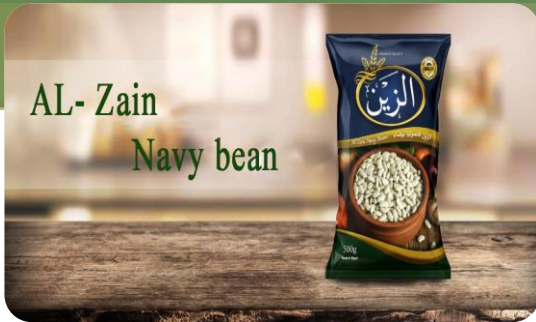
AL- Zain Navy bean

Picked and Packed White Beans. From the finest types of legumes.