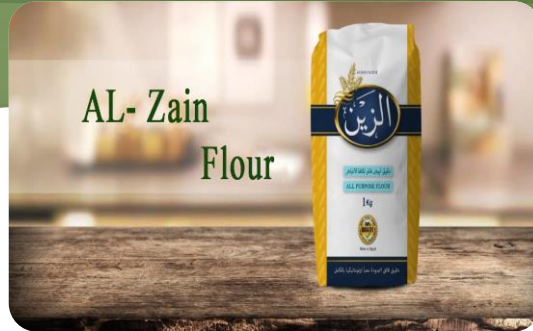
AL- Zain Flour

Rich White Flour. Suitable for all uses. Extracted from the finest types of wheat.